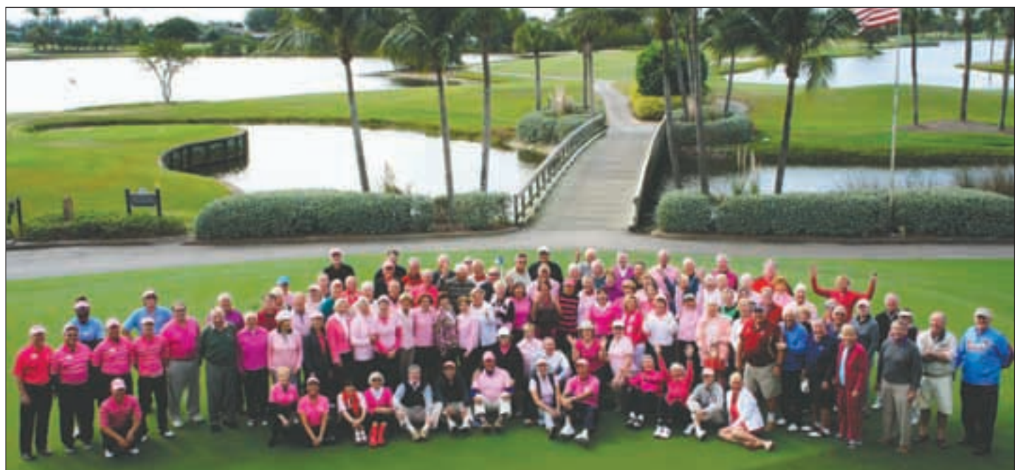
The group gathered for a photo on the green

Play for PINK is a grassroots organization dedicated to raising funds to fight breast cancer by creating and promoting awareness of breast cancer through sporting and lifestyle events including men's and women's golf tournaments, tennis, swimming, card games, equestrian events and shopping benefits. The organization's